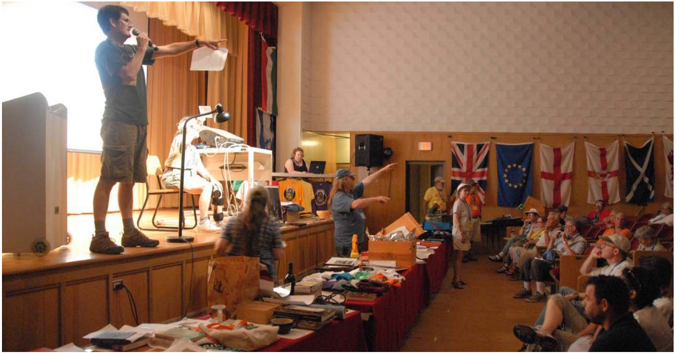
The first ICS Auction raised money for the UIS and the host organization, the U.S. National Speleological Society, from donated speleological books, art, supplies, and historical items.