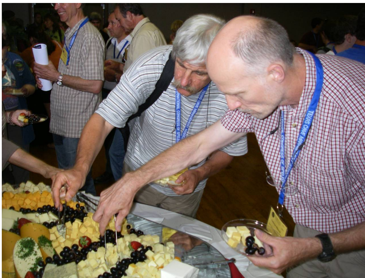
Speleologists from around the world enjoying the opening reception of the 15 th ICS.

If the new UIS Bureau is doing nothing with the height of annual fees for member countries, the UIS can face problem of lack of money if the donation program is stable, contributing the IJS, the BBS, and with operational costs we have. The review of available money for UIS since 1995 illustrates this well.