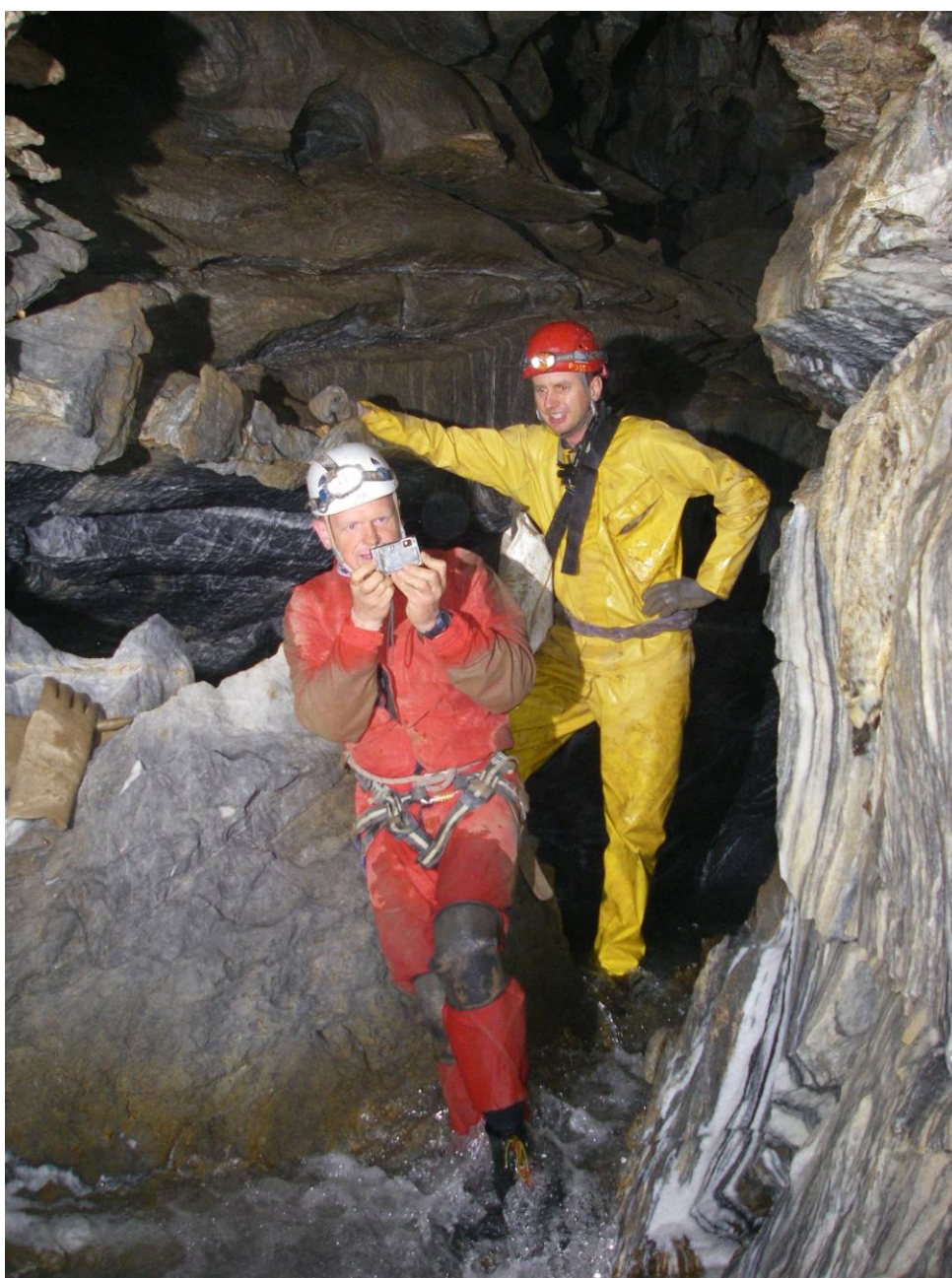
15 th ICS pre-Congress field trip to Lilburn Cave, California, USA.

Excavations should remove only a fraction of the deposit of interest to ensure that a major portion is left untouched for future work.