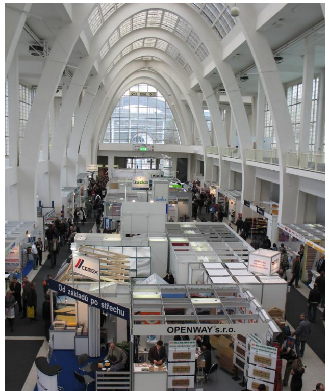
Exhibit Hall for the 16 th ICS.